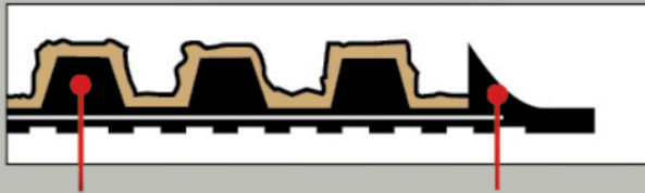
Rubber reinforced textile Rubber border