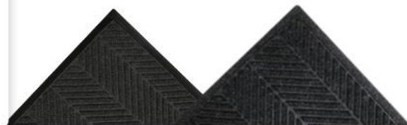
Fashion Fabric Border