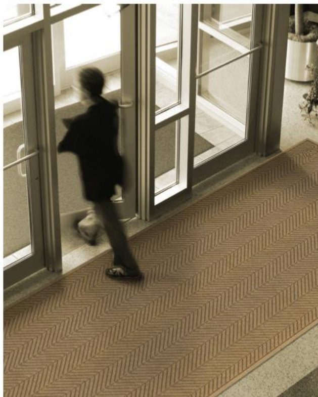
Classic Rubber Border

Mat sizes are approximate as rubber shrinks and expands in conjunction with temperature and time. Tolerable manufacturing size variance is 3-5%.